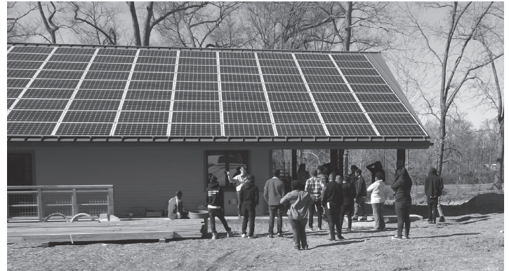
Retreat youth tour the construction site for a net-zero energy building, meeting engineers and landscapers.

The retreat stayed close to home, partnering with the Hard Bargain Farm retreat center in Accokeek, Maryland, and the University of the District of Columbia. Participants got hands-on exposure to a spectrum of careers in energy, agriculture, and law. At the farm, youth bonded over learning to milk a cow