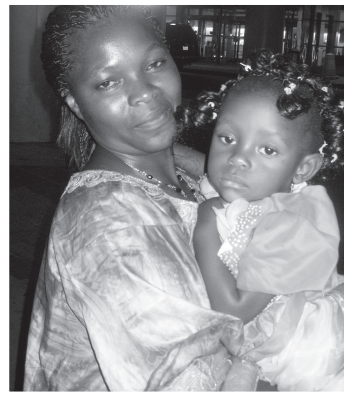
Dressed in their finest attire to begin their new lives, a newly arrived family from Congo arrives at BWI.

Both parents are already taking English classes and are starting the process of job-hunting so they are able to provide for their family. We are grateful for our partnership with LIRS and Christ Lutheran Church – with their help and your support, we have been able to provide this large family with the guidance and basic needs they require to begin their hopeful new life in America.